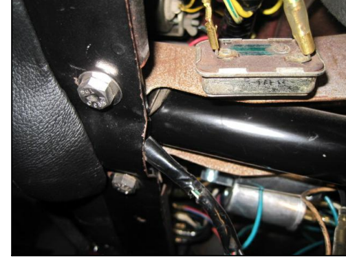
GVR - Mounted to the side of the steering column support.