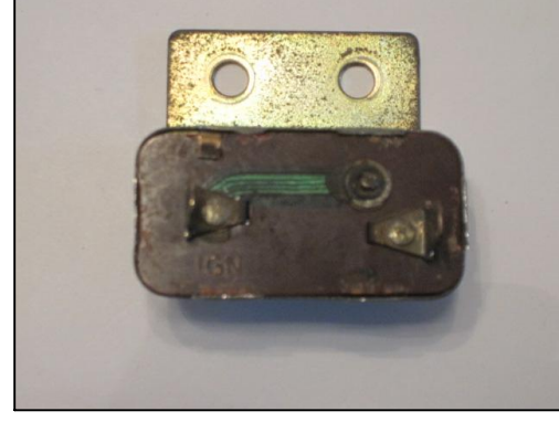
GVR - Old Style